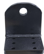
Larger Bracket to suit DO45 Style Couplings