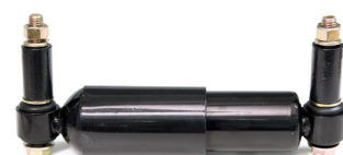
Shocker Kits available