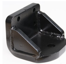
Standard 50mm and 70mm Ball Mount