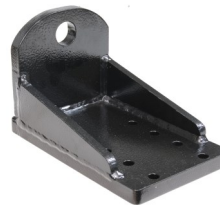
150mm Drop Bracket to suit 50/70mm Ball