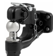
Standard bolt pattern to suit various Pintle Hook setups